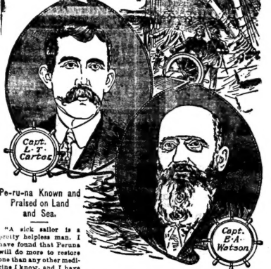
Pe-ru-na Known and Praised on Land and Sea.

"Give Me My Compass and Pe-ru-na and I Will Steer Clear of All Wrecks."